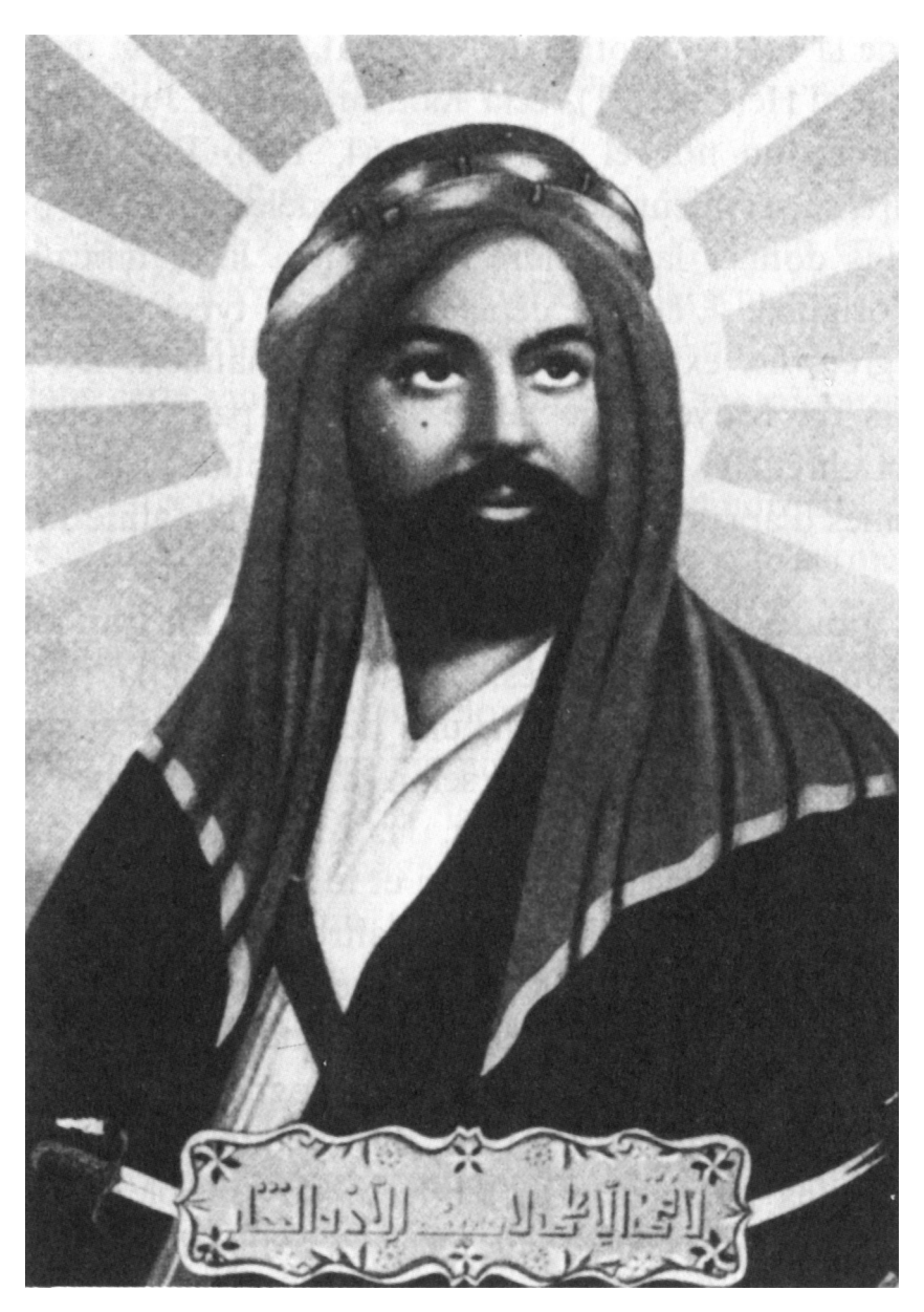
Fig. 1: A modern picture of Ali (on a Persian postcard). The text below the picture gives the well known titles of Ali: "There is no hero like Ali, nor any sword like Dhu 'l-faqâr."